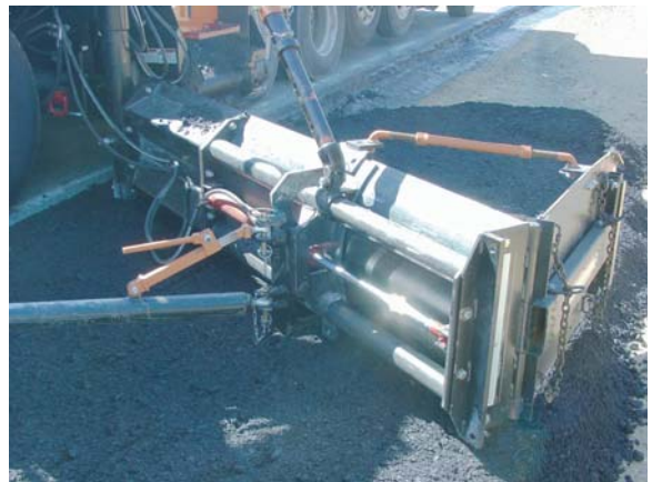
Modular blade sections with optional 2-4 ft hydraulic extension