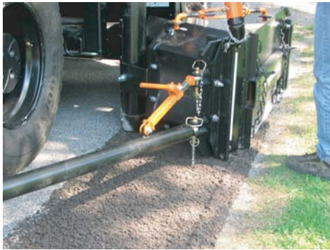
SPD-12 can handle narrow widths when needed