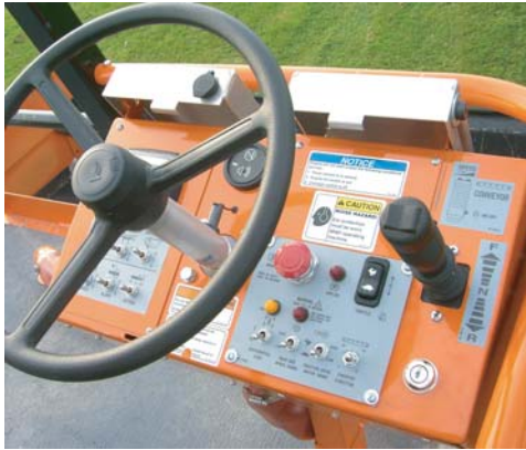
All machine functions in the operator's reach. Console moves to either side for right or left hand spreading